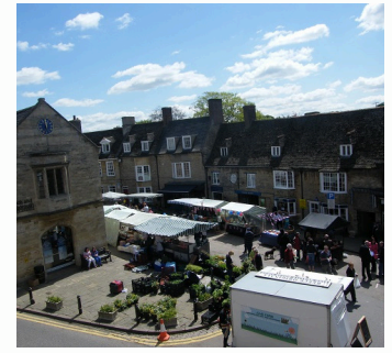
Oundle Town Markets survey 2024

Scan the QR code to access the survey, and help us help you!